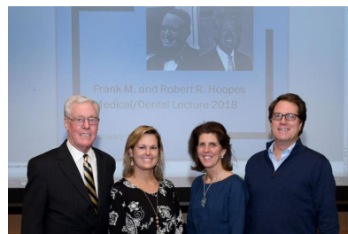
The Hoopes Family