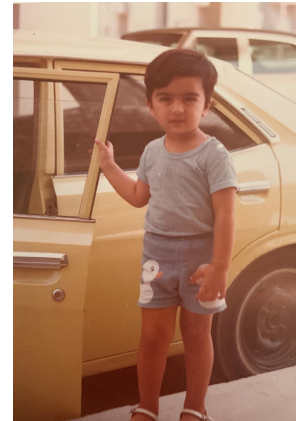
Image to the right: Me with Corona: A 1976 Toyota Corona, to be exact.